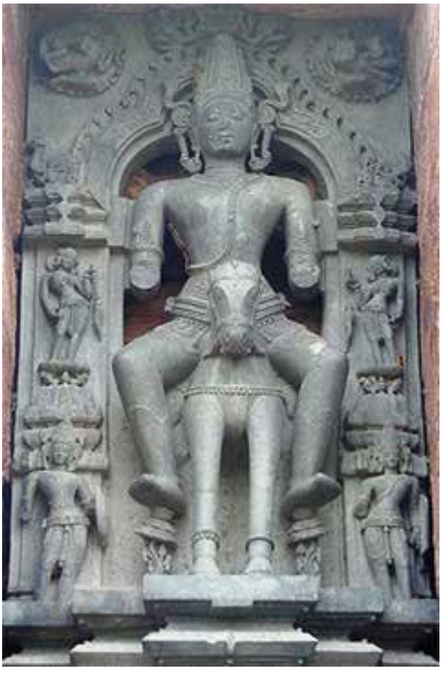
- The Preserver

Mangala (Mars) being the warlord, holds a kattara(cutter) in his right hand and in the left, several human heads, in the act of devouring. His vehicle is a goat.