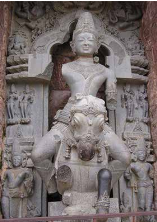
- The Destroyer